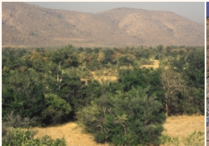
Scrub jungle with open areas are the preferred habitat of the Jerdon's Courser. Explosives blasted the hillock to cut the canal thus damaging the critically-endangered Jerdon's Courser's habitat.

1) the realignment of the canal constructed around the eastern part of the Sri Lankamaleswara Wildlife Sanctuary; and 2) that the sanctuaries be enlarged to incorporate important Jerdon's Courser habitat currently on the fringes or outside their borders.